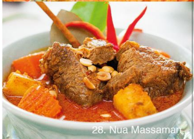
28. Nua Massaman