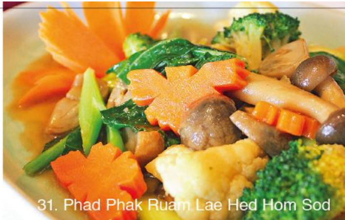
31. Phad Phak Ruam Lae Hed Hom Sod

PRICES ARE INCLUSIVE OF SERVICE CHARGE AND GOVERNMENT TAX.