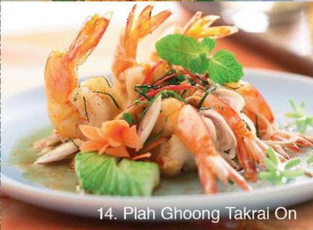
14. Plah Ghoong Takrai On