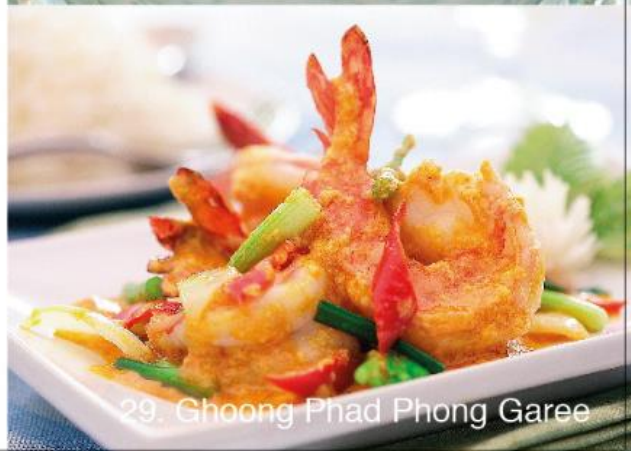
29. Ghoong Phad Phong Garee