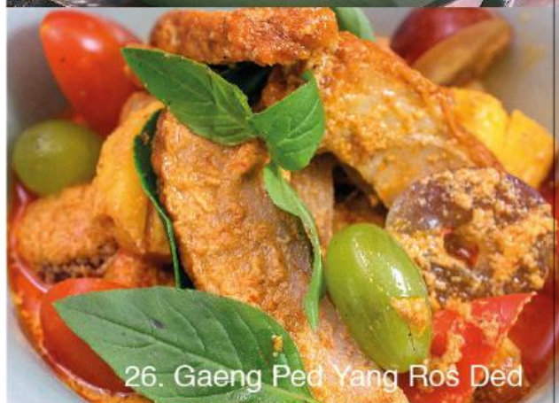
26. Gaeng Ped Yang Ros Ded