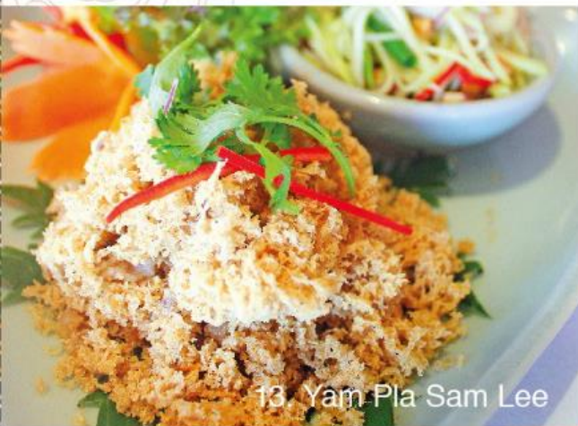
13. Yam Pla Sam Lee