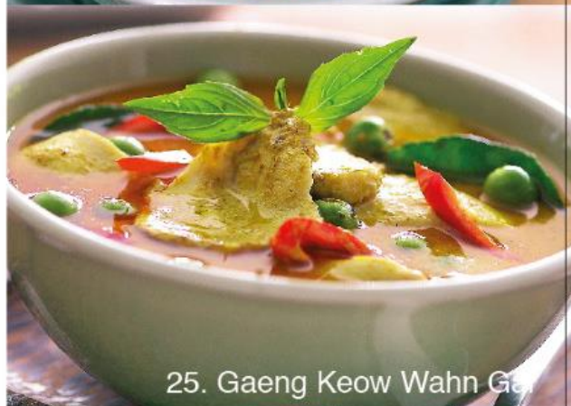
25. Gaeng Keow Wahn Gai