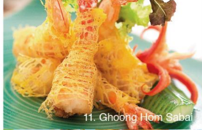
11. Ghoong Hom Sabai