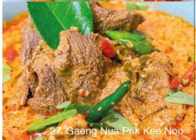
27. Gaeng Nua Prik Kee Noo