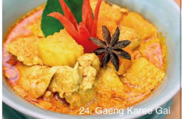
24. Gaeng Karee Gai