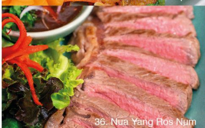
36. Nua Yang Ros Num