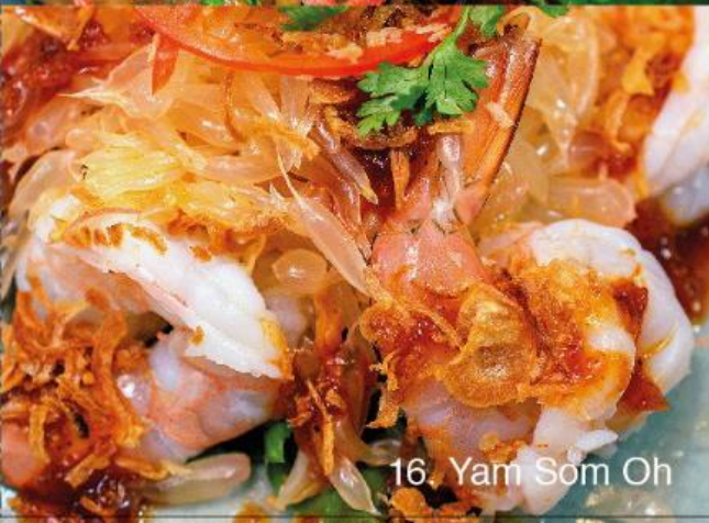
16. Yam Som Oh