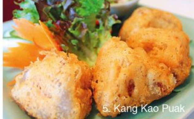
5. Kang Kao Puak

PRICES ARE INCLUSIVE OF SERVICE CHARGE AND GOVERNMENT TAX.