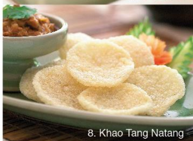
8. Khao Tang Natang