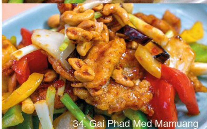
34. Gai Phad Med Mamuang