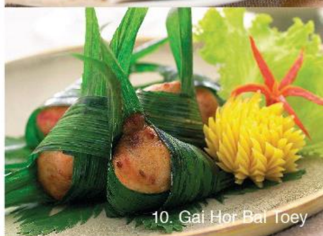
10. Gai Hor Bai Toey