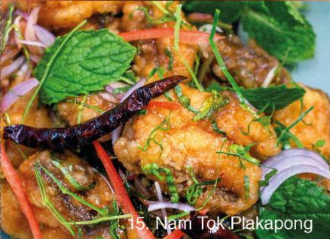
15. Nam Tok Plakapong